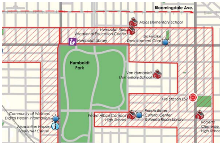
Humboldt Park’s Smart Community Plan calls for technical assistance to businesses in commercial corridors (shown in red) and expanded access to computers and services at local organizations.