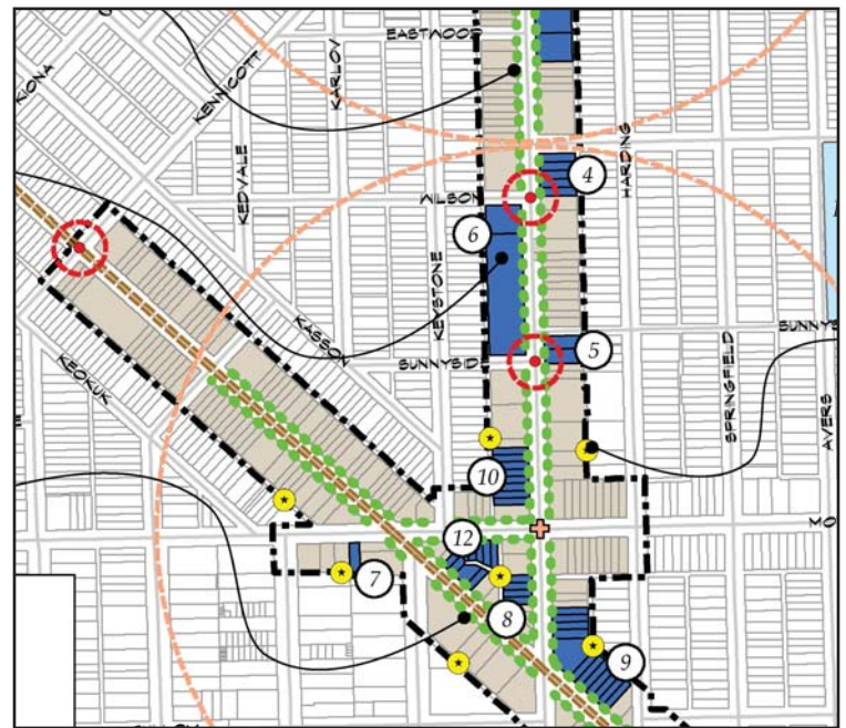
Potential redevelopment opportunity sites (shown in blue).

Working together with the PEBA Board and local stakeholders, Teska identified 6 major recommendations for the Plan, as well as a series of next steps that PEBA can immediately pursue to maintain momentum and begin implementing the strategies.