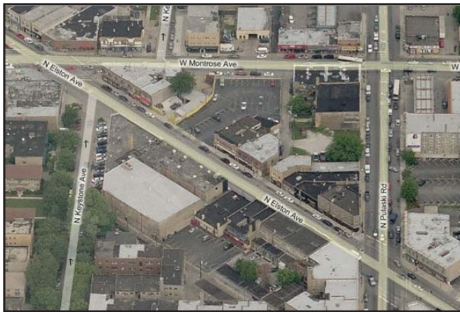
The Pulaski/Elston/Montrose triangle provides the opportunity to act as the hub and business focal point through enhanced streetscapes and broadband infrastructure to serve the area.