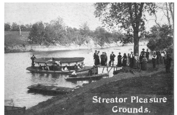
Streator Pleasure Grounds.