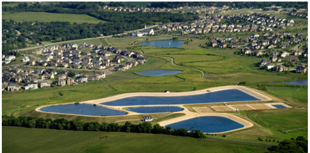
Fox Mill, a 730 unit residential development in Wasco, Illinois has been operating since 1993, treating all water on-site to prevent discharge into Mill Creek, a high quality nearby stream.