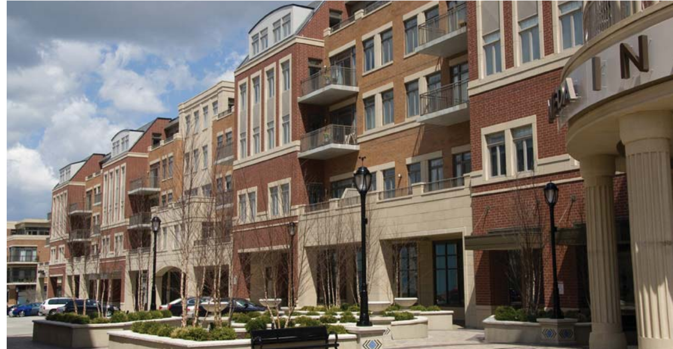
4 Stories | 49 Feet | Park Ridge, IL