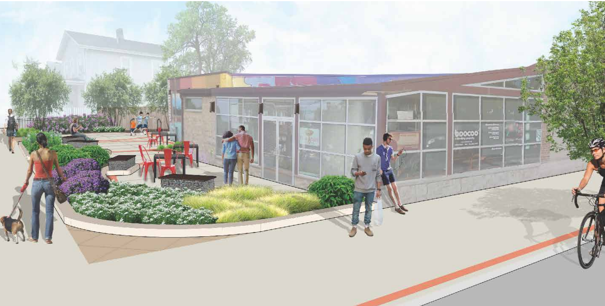
view looking northeast