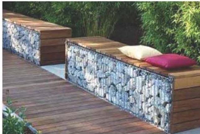
gabion bench with reclaimed stone materials