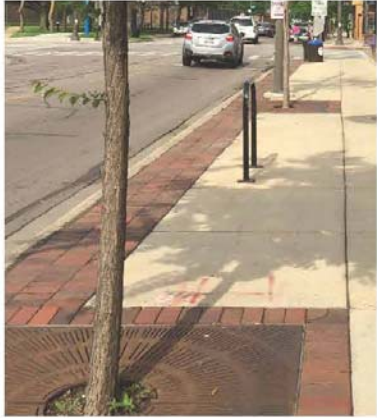
concrete paving with clay brick border