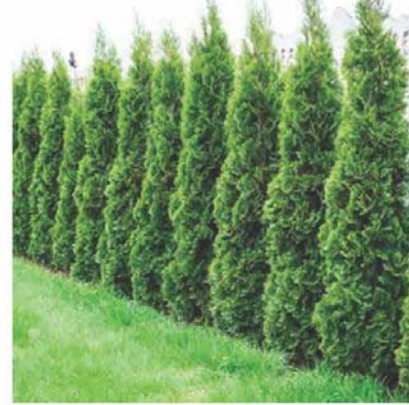
upright evergreen plantings