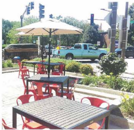
bistro tables and chairs