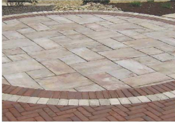
precast concrete paver accent