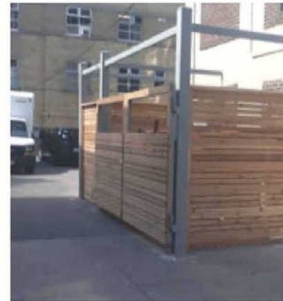
aluminum and wood trash enclosure