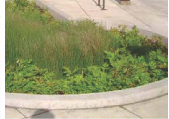
wet tolerant bioswale plantings