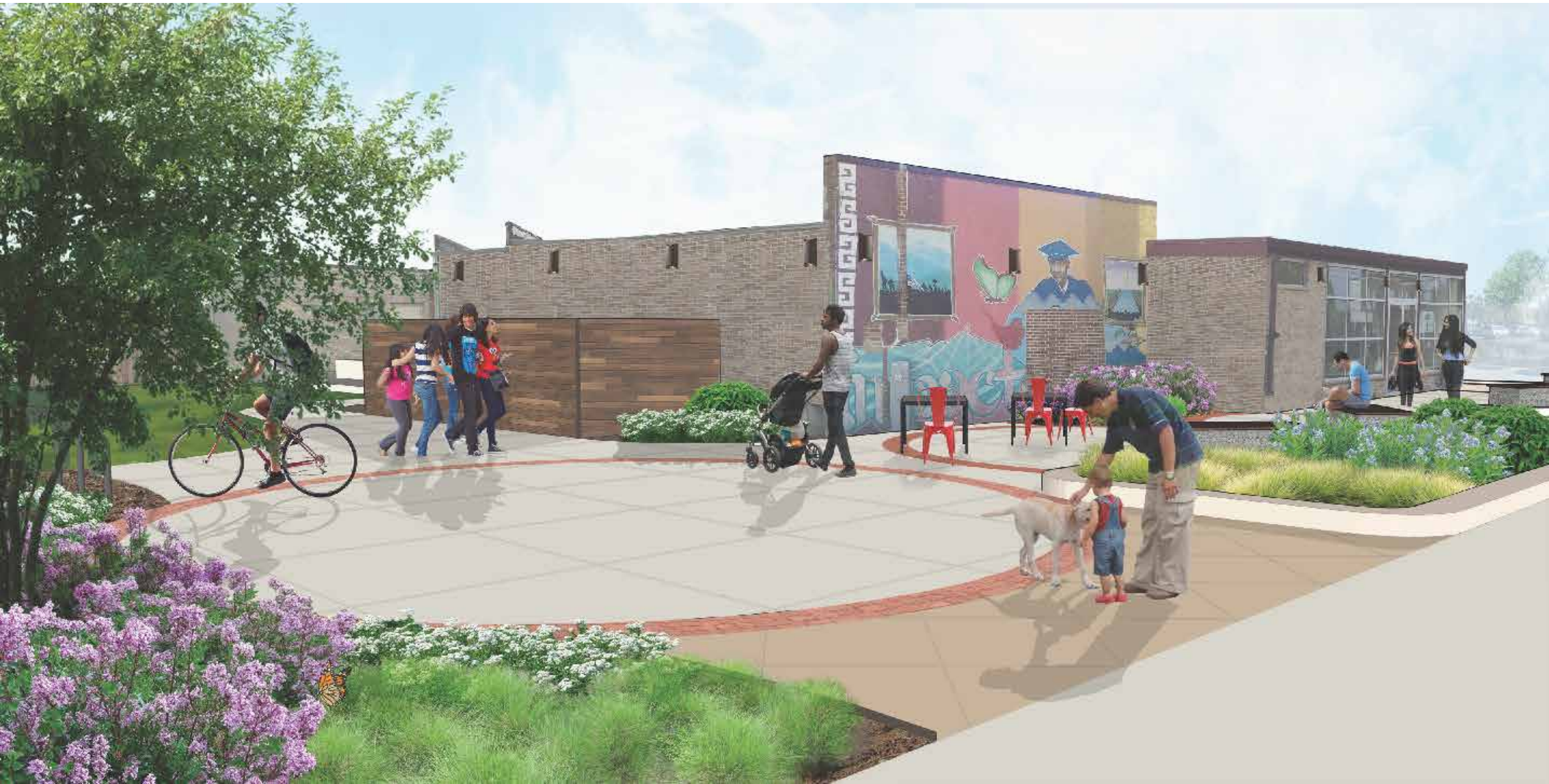
view looking southeast