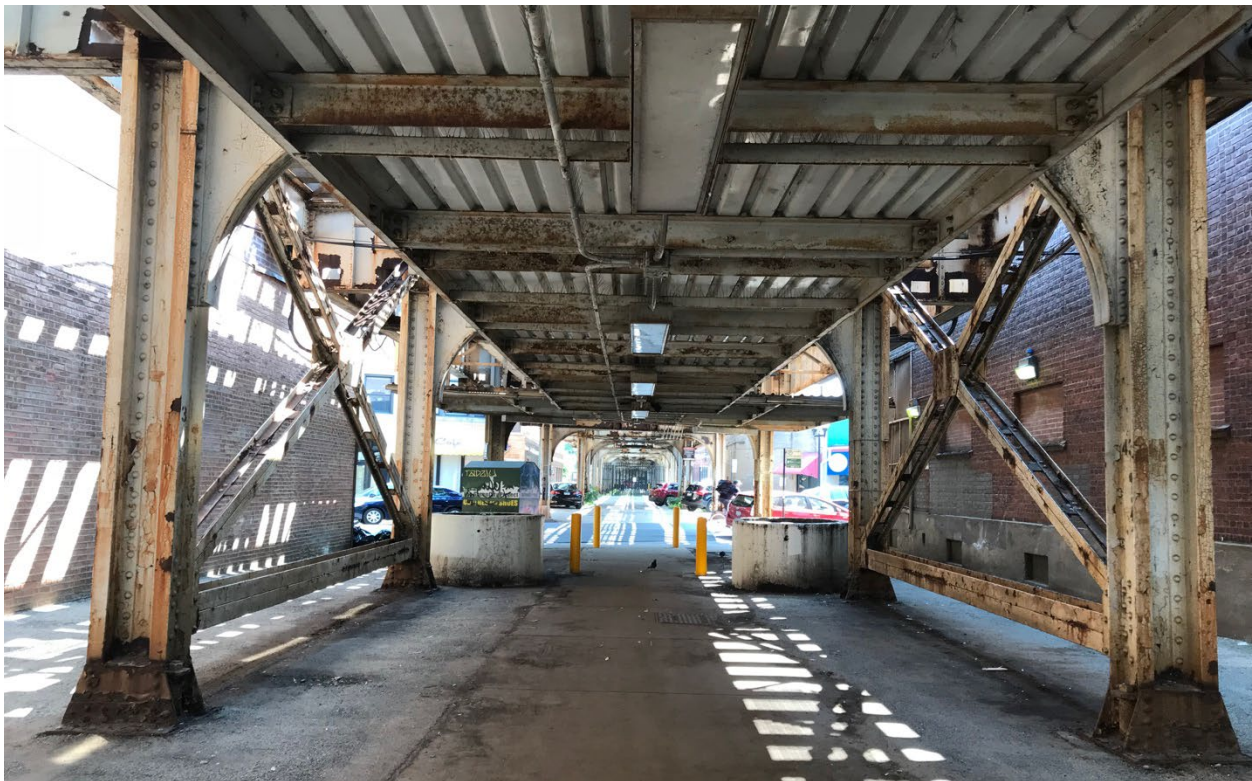
View of current ped path beneath the Brown Line CTA Western Stop.