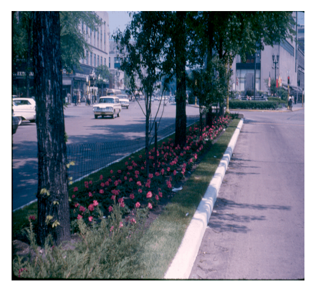
Landscaped Median on Sherman Avenue