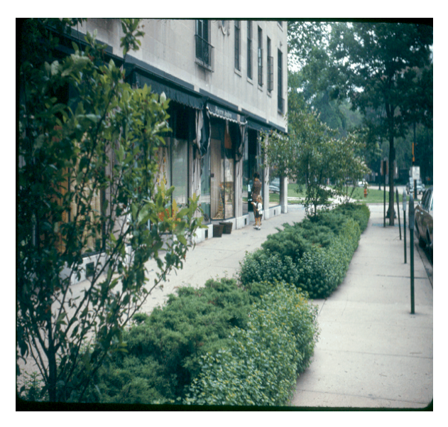
Chicago Avenue Streetscape

Except for Dominick's food store with its parking lot on the north side of Church Street, the triangle between the CTA and Northwestern railroad tracks was an unsightly and incompatible mixture of landuses. These included the City of Evanston Public Works facilities and animal shelter, the Northwestern University maintenance facilities, a Commonwealth Edison transformer, and several deteriorated residences. This was clearly not a part of the downtown for which Evanston was famous.