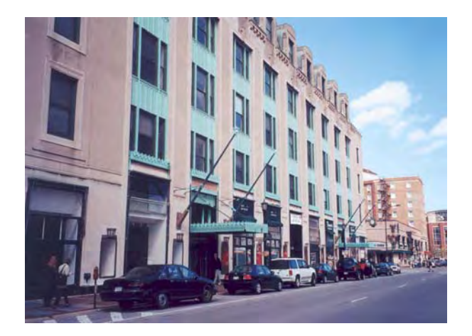
Former Marshall Field's Store

Downtown maintained an excellent variety of apparel and fashion stores, including Rothchild's, Baskin's, Lytton's, Betty's of Winnetka, Peck and Peck, the Hawaiian Shop, and more. Furniture, too, was strongly represented, with such highly regarded names as Smythe's, Colby's, and Stein's. The Kroch's and Brentano's book store was one of the prestige Chicago chain's most successful outlets. And, of course, the Student Book Exchange was a big hit with university students.