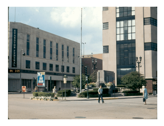
Financial Institutions Anchored Fountain Square