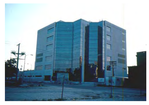
Basic Industrial Research Laboratory

The Technology Innovation Center at 1840 Oak and the 1033 University Office Building opened in 1990; the 906 University Place Incubator continued to hold overflow, start-up companies; and the 30 dwelling unit Ivy Court townhouse and home office project was occupied in 1998. Subsequently, the 1880 Oak flex-space building opened in 2000 and the Evanston/Northwestern Healthcare Research building at 1001University Place opened in 2001.