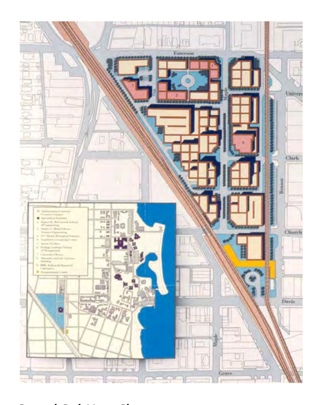
Research Park Master Plan

The Technology Innovation Center (a small business incubator) opened in June, 1986 and the state-of-the-art, 130,000 square foot Basic Industrial Research Laboratory opened in November, 1987. Arthur Anderson Systems Integration Center became its first tenant. Shaw began construction on its first building at 1890 Maple Avenue (designed by A.M. Kinney Associates) in April, 1988. The three-story, 43,000 square foot building's first tenant was the NU sponsored Institute for Learning Sciences which focused on artificial intelligence. Interior space was designed by Moretta and Sheehy Architects. Both firms were headquartered in Evanston.