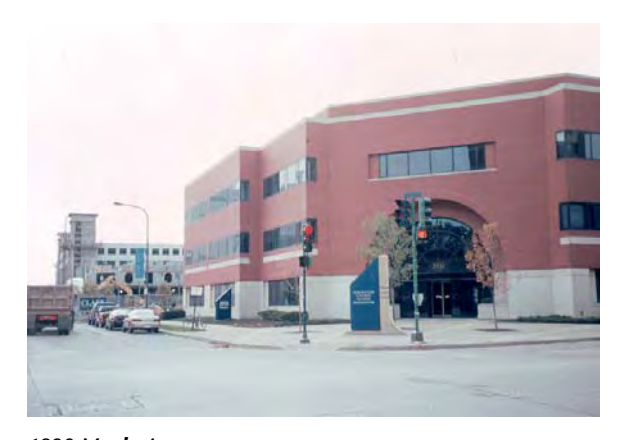
1890 Maple Avenue