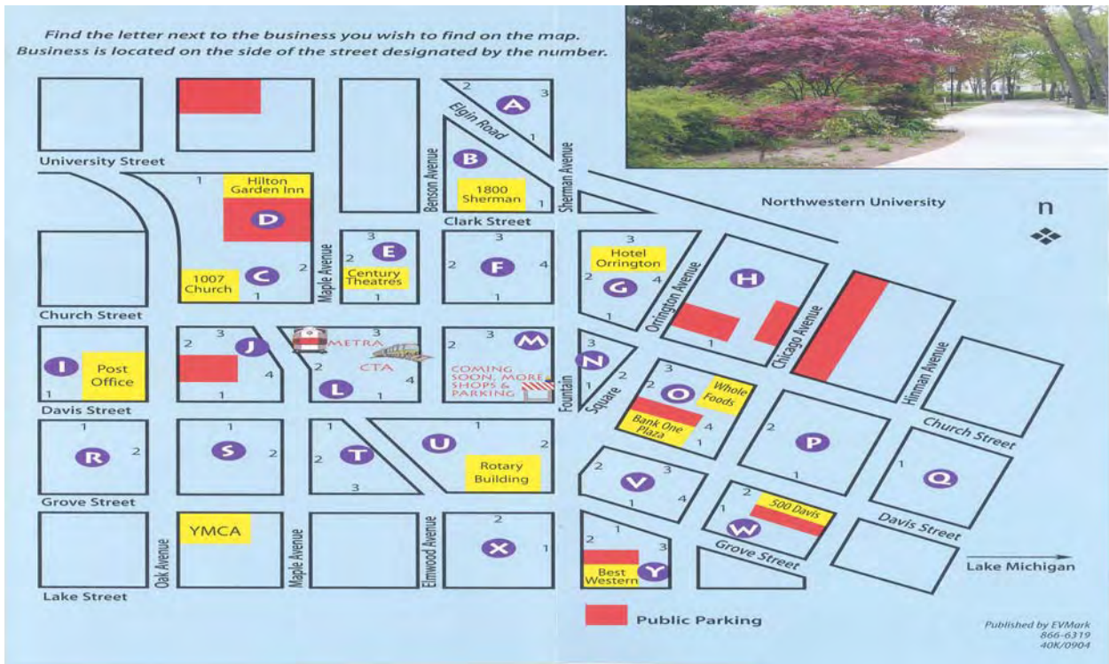
Business Directory