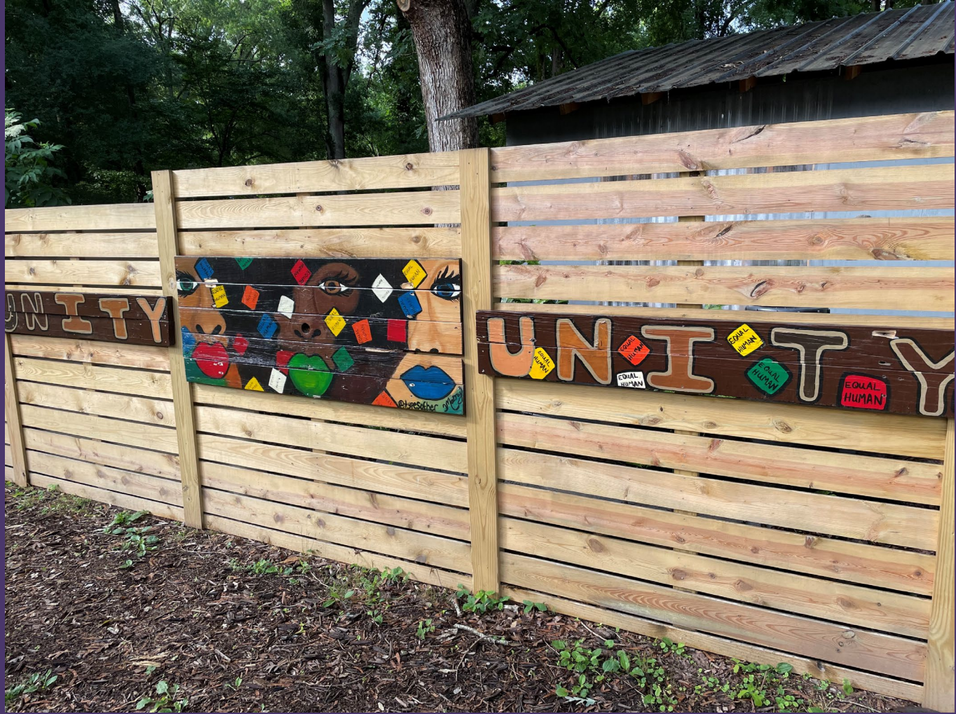
Present Day on Main