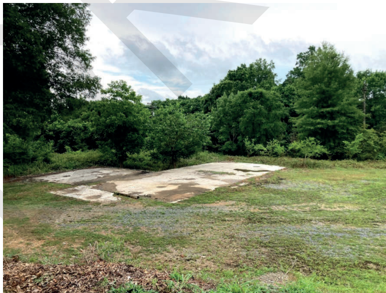
Measuring soil organic matter content, organic matter respiration, and loss-on-ignition tests can be used to measure Carrboro's soil quality.