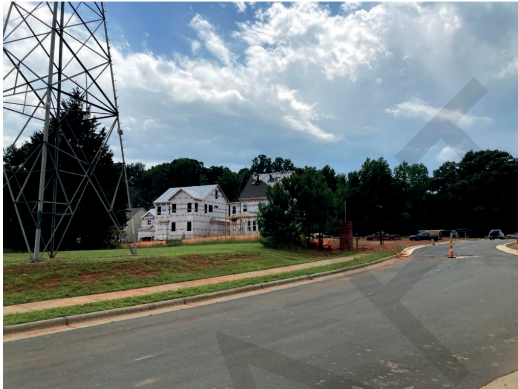
New construction of housing often includes energy efficiency updates.