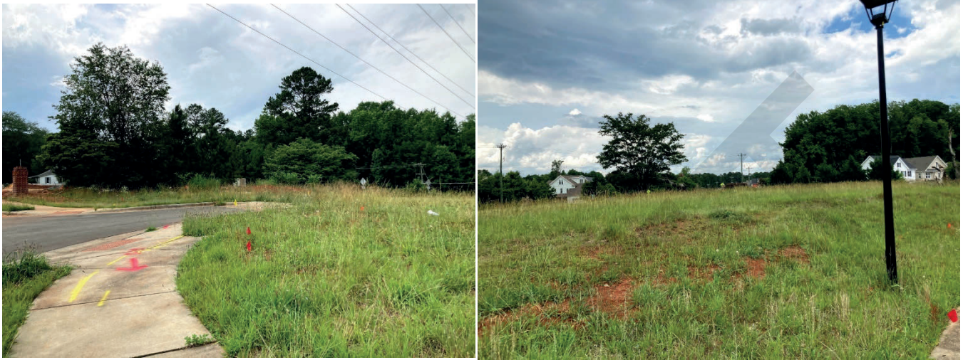
Potential spaces for native plantings and increased tree canopy.