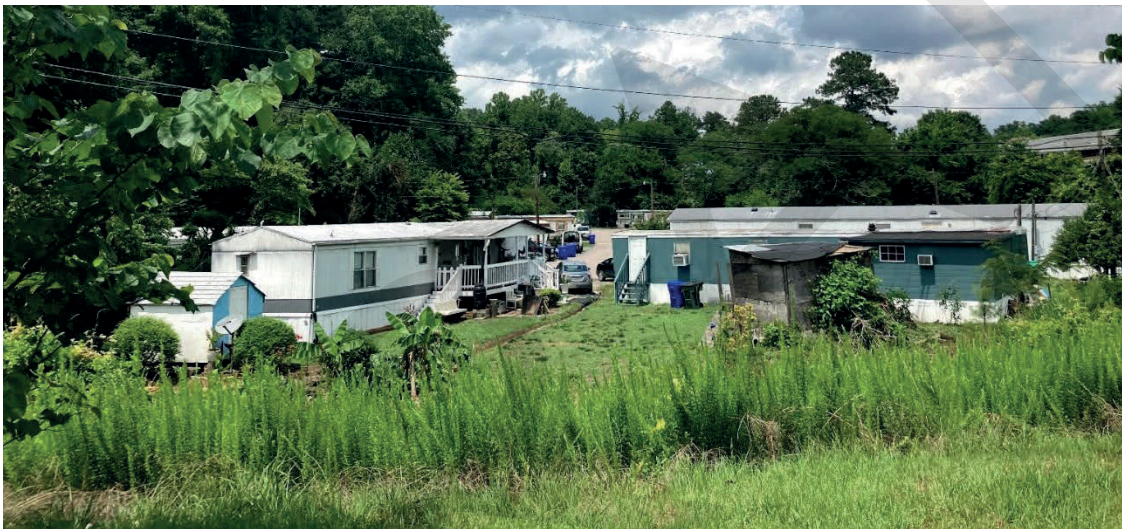
The Town of Carrboro is already implementing stormwater projects in this low-lying neighborhood that experiences flooding.