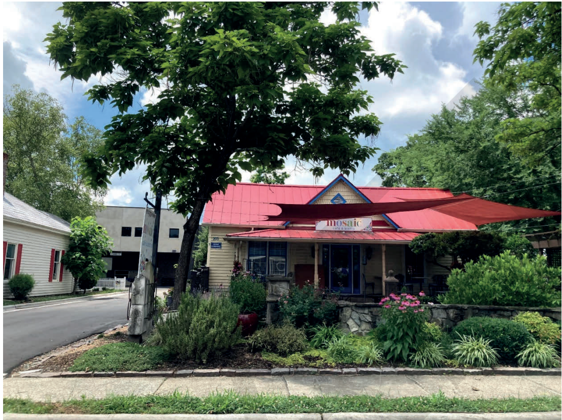
Example of native plantings around Carrboro.