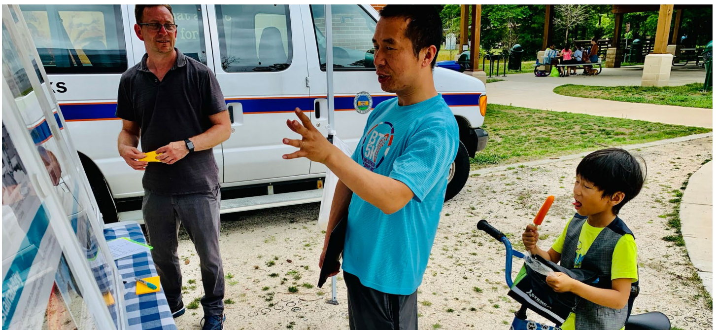
▲ A young bicyclist attending one of the Carrboro Connects Pop-Ups

R Encourage people to "leave their cars behind" by continuing to coordinate biking and walking tours in different parts of Town.