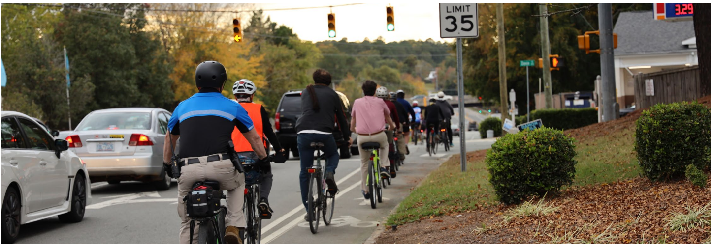
▲ Image from October 2021 Community Bike Ride

"Introduce recreation in transportation planning... Bikeways and sidewalks start to get to that [by connecting to recreation and amenities]." —Resident idea