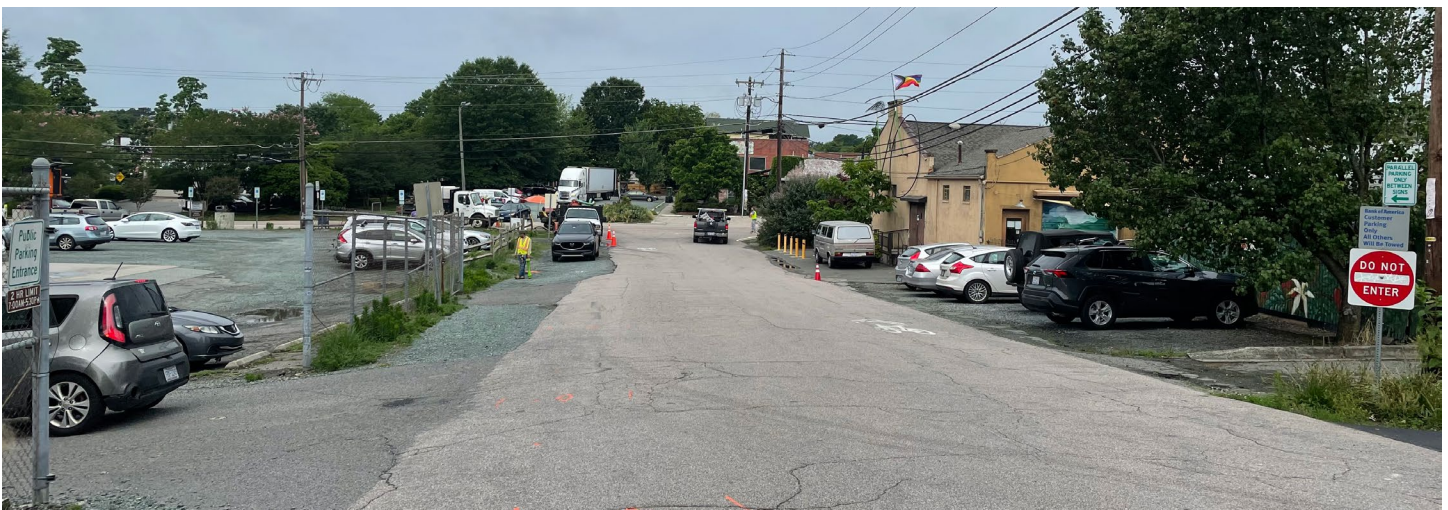
▲ Roberson Street, next to The 203 Project, would be a great opportunity for a shared street that can be used by pedestrians, micro mobility users, and drivers.

Implement plans that support safety for all age groups of children, especially those who have less opportunities due to location, ability, and income. Explore and develop partnerships with community organizations seeking to provide healthy and safe transportation options for youth and continue working to establish the SRTS Implementation Committee.