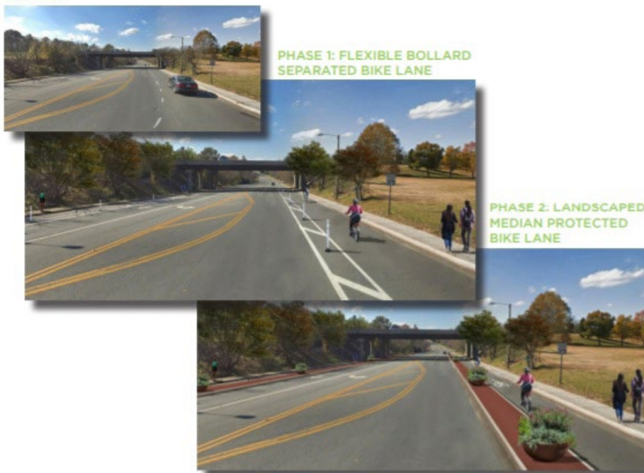
◀ Jones Ferry Road Protected Bike Lane design in phases (from Main Street to Davie Road), Carrboro Bike Plan 2020.