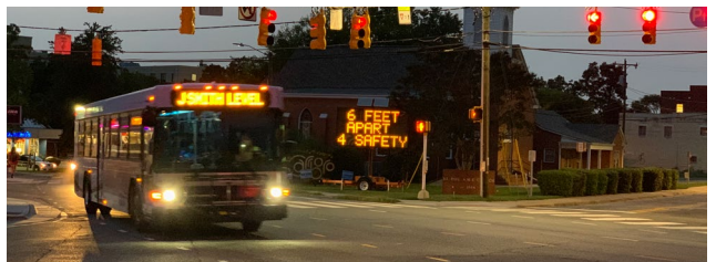
▲ Extending bus service to include off-peak and weekend hours can better serve residents employed by service-oriented jobs. Funding would be needed to extend such service.