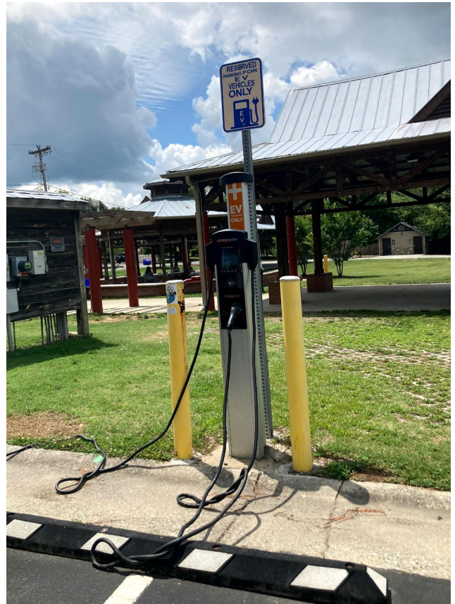
▲ Electric vehicle charging station at Town Commons

E Promote the interconnectivity of local and regional bicycle infrastructure, transit, and other micromobility options between Carrboro, Chapel Hill, Orange County, and other jurisdictions and organizations in the Triangle Region.