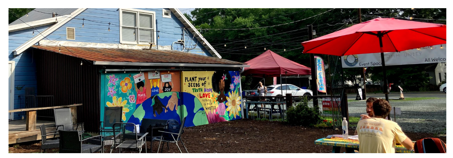
▲ Present Day on Main provides a gathering space for local residents and is an example of a BIPOC-owned business that is bringing people together through food, culture and music

Based on an inventory of needs of local businesses, provide support for technology upgrades to be more competitive online and in-person. The Town can connect local, BIPOC and other diverse businesses to regional training providers that provide technical skills, software, and certifications.