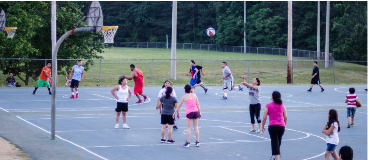
▲ Carrboro's parks offer many well-used sports facilities like these courts pictured here at Anderson Park. Through engagement, many expressed desire to see more multi-purpose fields for soccer and other sports.