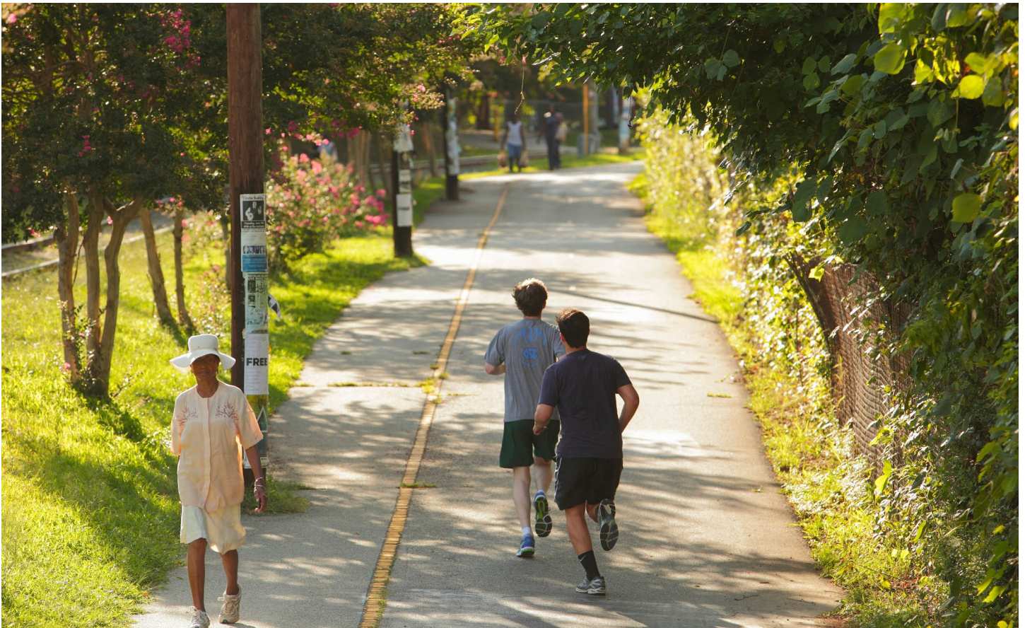
▲ Libba Cotten Bikeway (rail with trail)

Identify specific needed improvements for sidewalks, bike paths, and transit routes to enhance multi-modal access to parks, including proximity and enhanced connections to recreation and park facilities as a criteria for evaluating and prioritizing transportation projects. Higher priority may be given to projects which are most needed due to existing safety and vulnerability, and those which increase connections and fill existing gaps in the network.