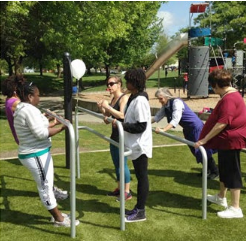
▲ Outdoor exercise equipment, pictured above, provides a free opportunity for people of varying abilities to work out individually or in a group. Pull-up bars in particular are becoming popular and have been specifically requested in the community engagement process.

"I love the little workout space at Collins Crossing! It's especially great because it has a variety of equipment in one space... Could we add more of these around town? Perhaps at the new MLK park, Simpson, Anderson, Wilson, etc." –Website comment