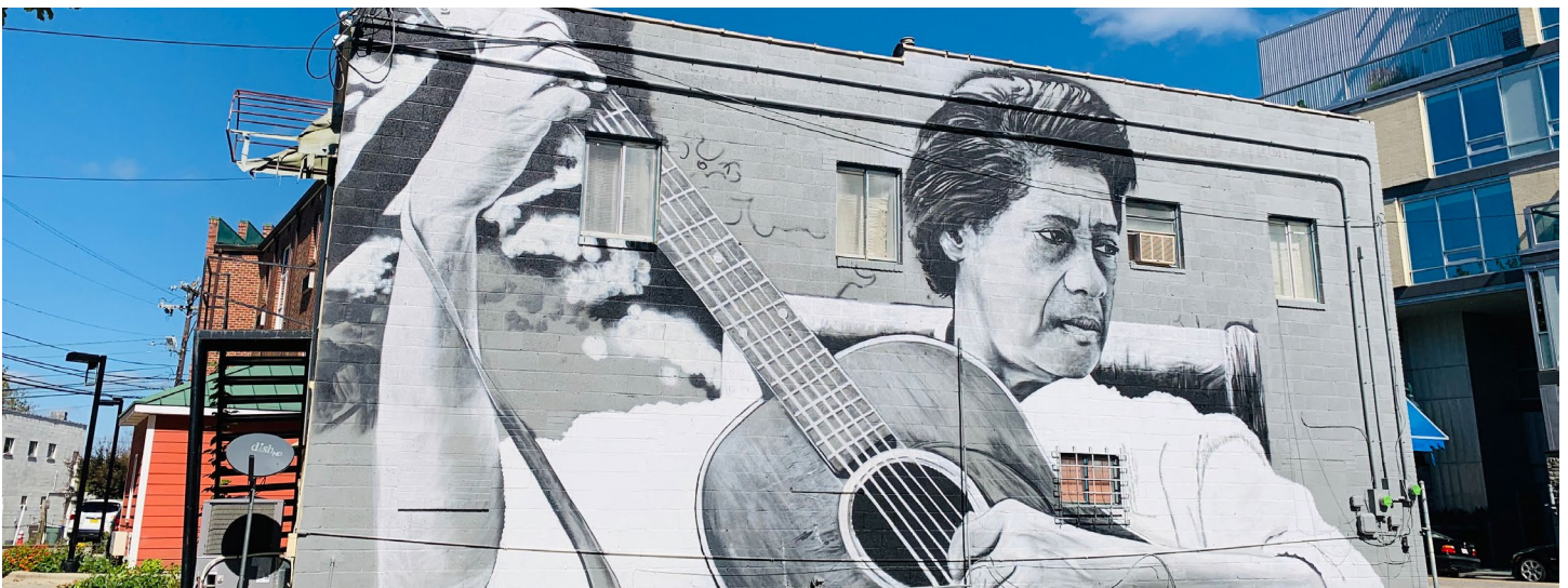
▲ This mural in Town depicts Elizabeth "Libba" Cotten, who was a blues and folk musician from Carrboro. Public art like this contributes to a vibrant sense of place while also celebrating the people who have contributed to the Carrboro story.

C Pursue more opportunities for people to organically express themselves and come together through art in the parks via temporary installations, using chalk art or portable paint boards. Partner with local organizations (e.g. NAACP) that can organize the activity or event and potentially showcase the artwork afterwards.