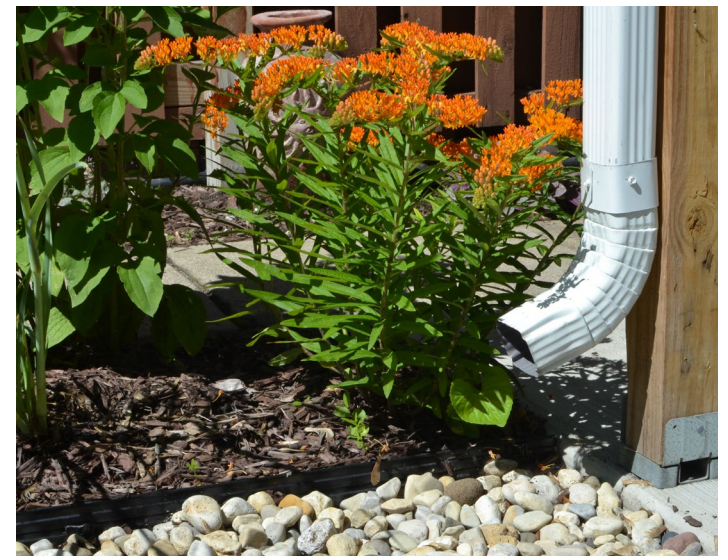
Impervious removal and disconnection