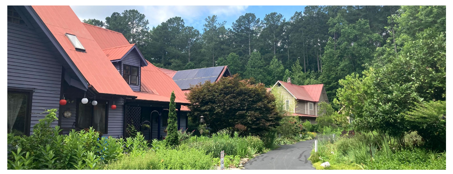
▲ Example of distributed renewable energy (solar panels). Identify opportunities to increase municipal or communitybased solar projects (ECPP), including funding to allow participation at a variety of income levels.

Explore options to increase renewable energy usage through Renewable Energy Credits (RECs) purchases or advocating reinstatement of state solar tax credits. Advocate with a coalition of other jurisdictions for reinstatement of state solar tax credits. Purchase additional RECs and advocate against policy barriers to purchasing more RECs.