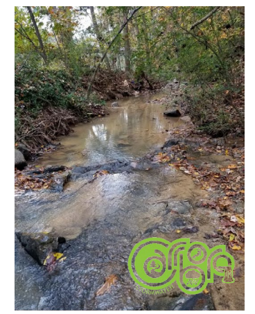
A HOMEOWNER'S GUIDE TO CARRBORO'S WATERSHEDS, CREEKS, AND STORMWATER MANAGEMENT

SEPTEMBER 2020 Prepared by the Carrboro Public Works Department, Stormwater Division and Stormwater Advisory Commission