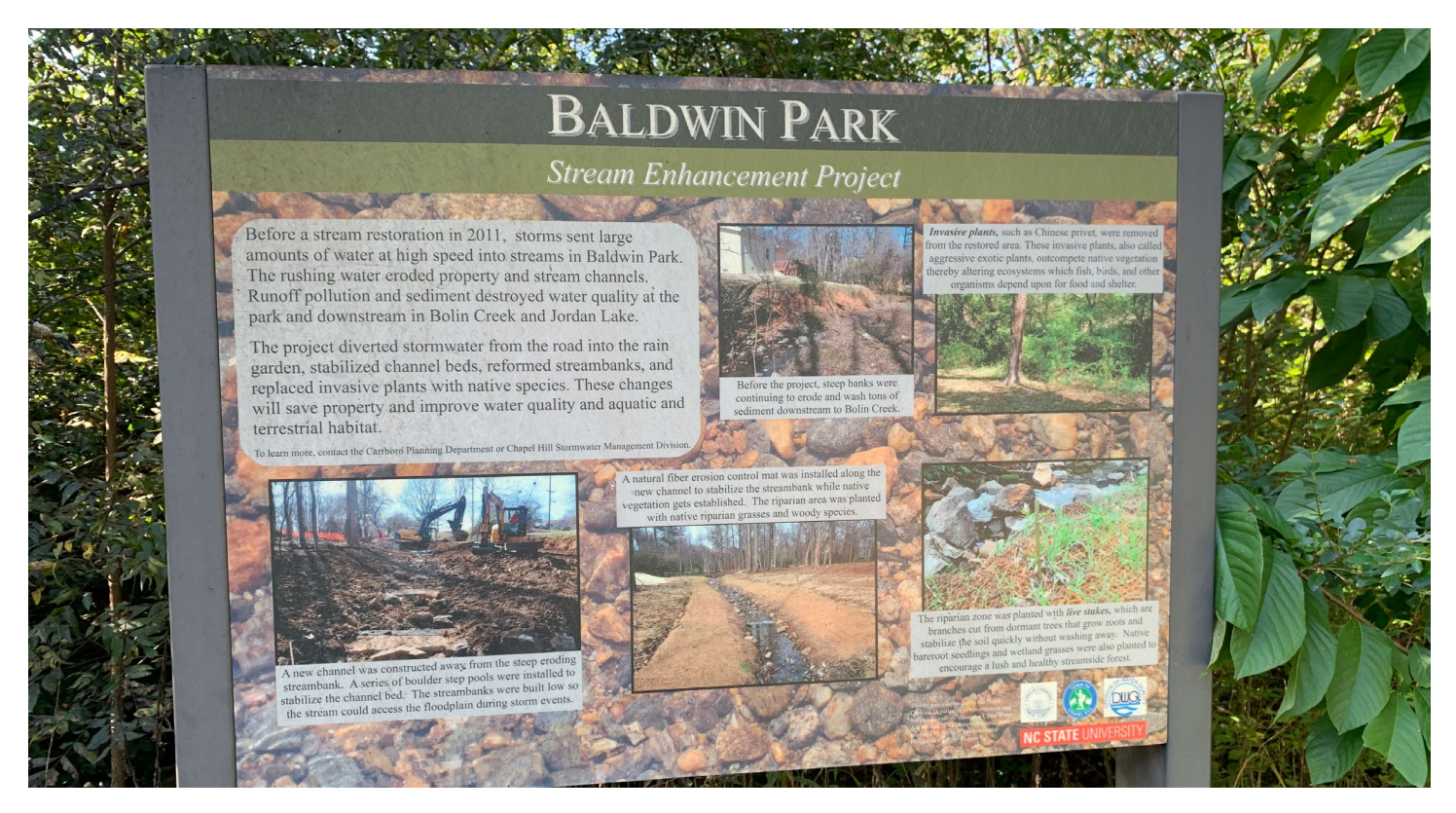
Example of public education about green stormwater infrastructure at Baldwin Park

Identify partner experts who can help develop and deliver typologies of retrofits with the highest likelihood of widespread adoption. Develop a public education campaign to publicize the playbook and lead "how-tos" on implementing retrofits. Provide technical assistance for retrofit projects.