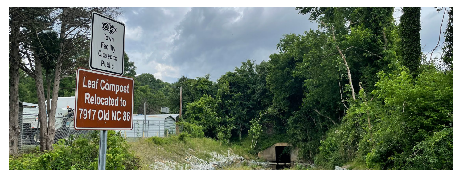
▲ One of the ways Carrboro can continue improving water quality is by pursuing stream restoration, enhancing stormwater runoff management projects.

To stabilize vegetation means to maintain existing vegetation at construction sites. This can help prevent erosion during precipitation events because the roots of vegetation keep soils intact. Current minimum erosion control requirements will likely be insufficient as climate change impacts increase. Carrboro can strengthen vegetation stabilization requirements as part of approval of construction permits.