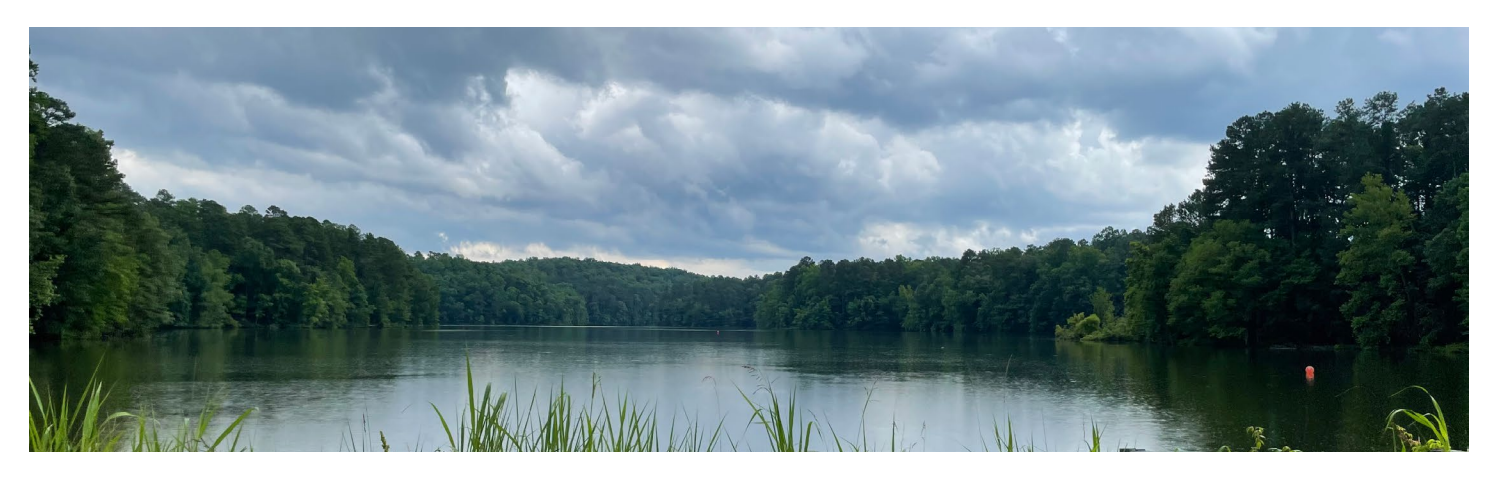
▲ Carrboro is committed to investing in and protecting all bodies of water and ensuring the health of these ecosystems and all the species that rely on them. Pictured here is University Lake, seen from Jones Ferry Road.

D Continue to administer procedures for detecting and removing illicit discharge sources.