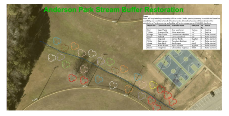
▲ Anderson Park Stream Buffer Restoration Project: This Town project has and will continue to host volunteer events to plant trees, create a pollinator habitat, improve water quality, install stormwater control measures, and provide education and outreach to Carrboro residents.

G Invest in the completion of a new significant restoration project. Identify priority locations for native plant restoration projects that support continuity of natural spaces, native pollinators, and residents' access to nature.