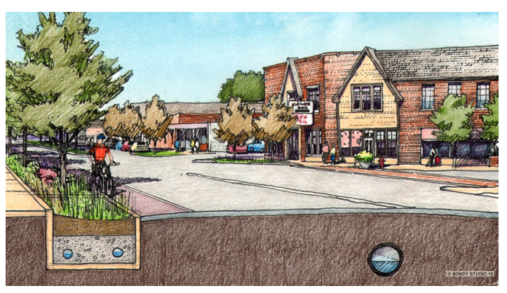
Tree planters with stormwater filtration

C Educate residents about the Town's definition of a greenway and its benefits, and foster discussion about greenways.